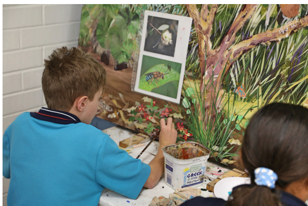
Above: a student at Caversham Primary School working on the biodiversity mural