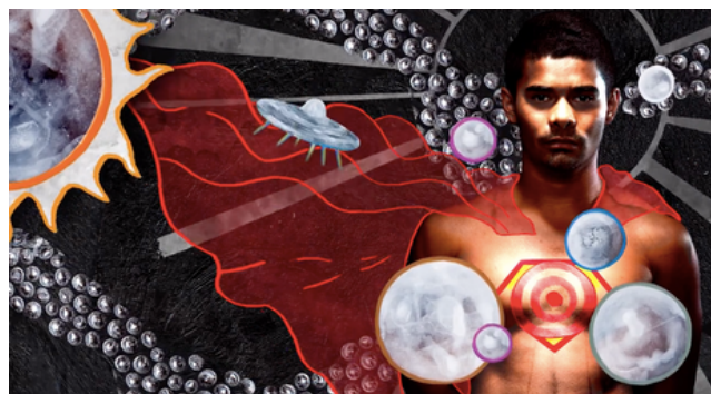
Image above: TA2019-58, Tony Albert, I Am Visible , 2019 single channel, 4K video (still)