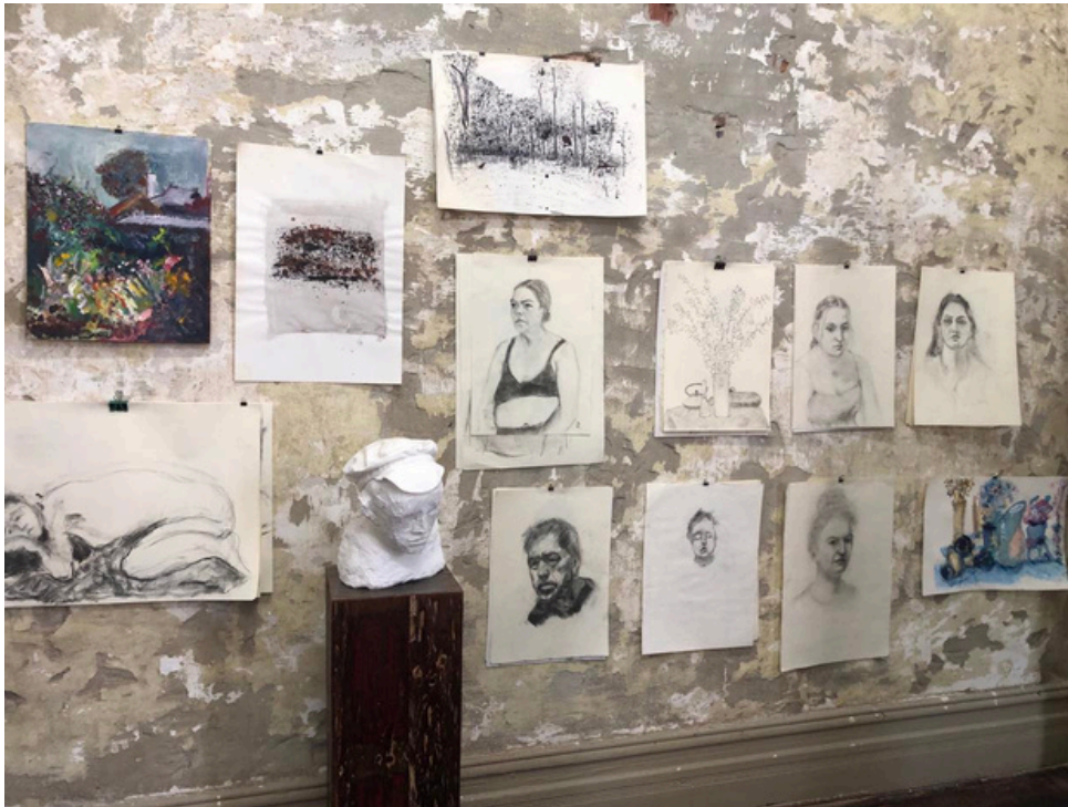
Image above: studio shot of David Leith's studio for Open Studios 2024