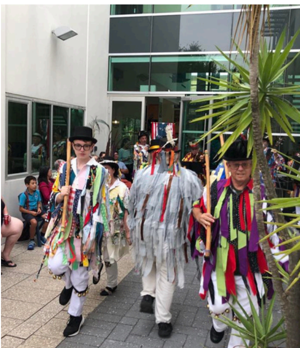
Above: the Morris Tatters performing at the Thank-A-Volunteer BBQ

On Friday, 24 May, we held a fundraising Morning Tea for Cancer Council's Australia's Biggest Morning Tea, held in partnership with Sister Project and the Ellenbrook Collective and supported by Venue Tech and Cancer Council. Approximately 150 visitors attended and enjoyed a morning of inspirational guest speakers, live music, and a huge spread of delicious morning tea donated by local bakers and community groups. We raised $2,000 in donations which went to the Cancer Council for cancer research and to support those affected by cancer.