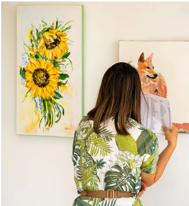
Above: a visitor to the member's annual exhibition, held each year in December.