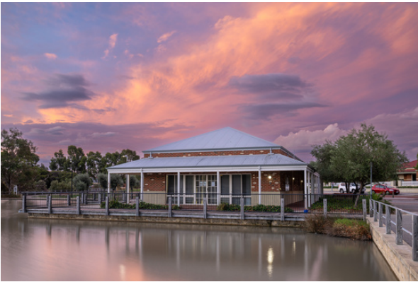
Above: The Grapevine