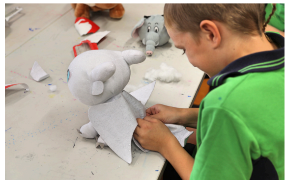
Image above: a student at Malvern Springs Primary School working on his creature