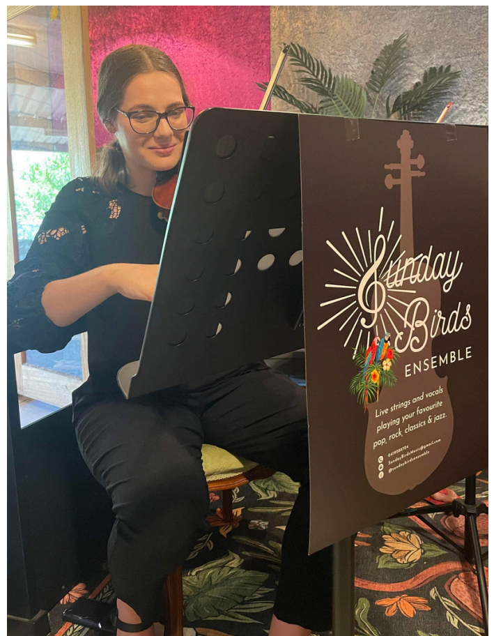
Above: Sunday Birds ensemble performing at the Ellenbrook Christmas Pageant