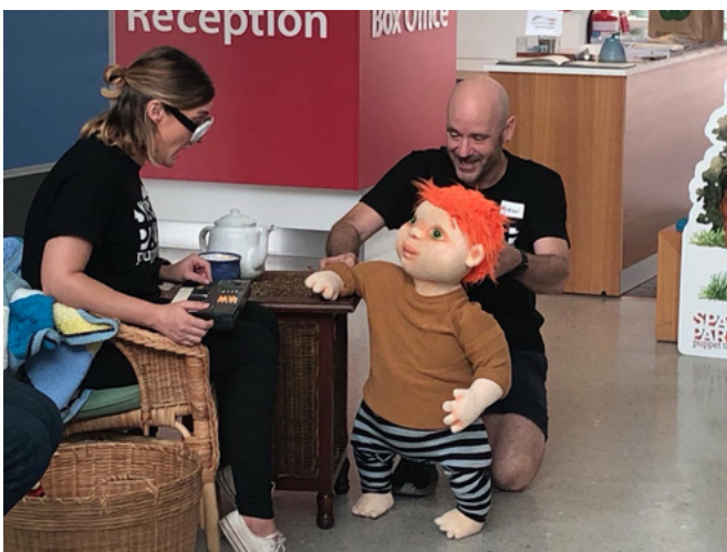
Above: Puppet Playtime with Spare Parts Puppet Theatre