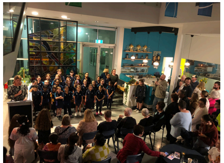
Above: HQ Community Space featuring a performance by the Aveley Primary School choir.

The Gallery continues to be at the center of our programming, with an annual program of exhibitions attracting a range of artists and community groups. Some exhibitions are self-generated and others offer the gallery as a space for hire. Exhibitions are generally on display for one month to six weeks and in total we offer approximately ten exhibitions per year.